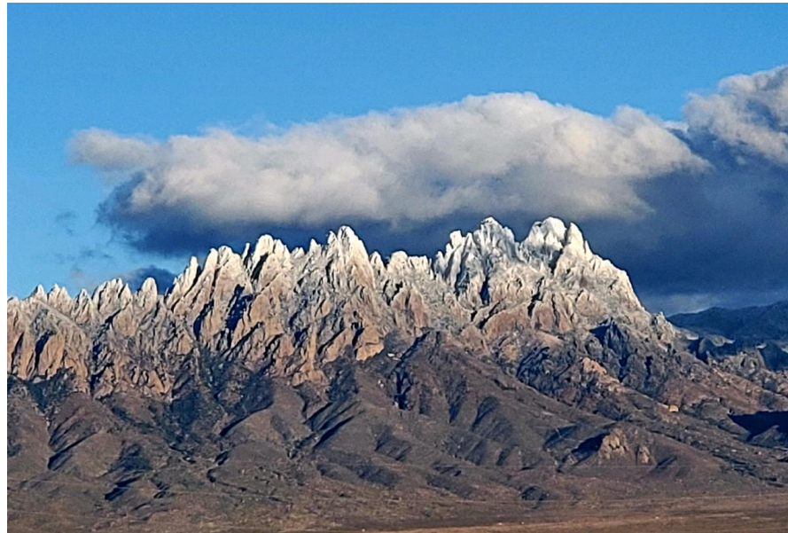
Snow Capped Organ Mountains, Las Cruces

On behalf of all colleagues at the Department of Health, we humbly acknowledge we are on the unceded ancestral lands of the original peoples of the Apache, Navajo and Pueblo past and present.